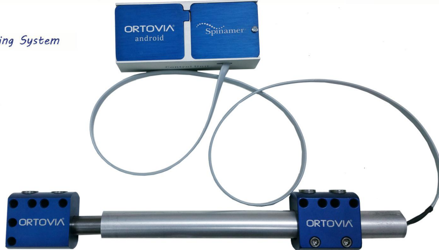
External Lengthening System