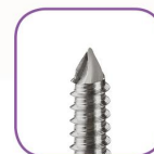
Unique Pin Tip