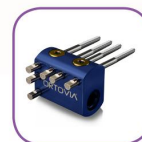
Multiaxis Pin Insertion