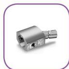
Smart 3D joint