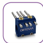
Easy Pin Holding